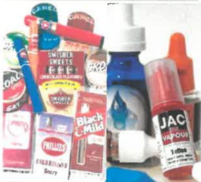
Little cigars, blunts, and smokeless tobacco in candy flavors

When you keep tobacco away from minors, everybody wins.