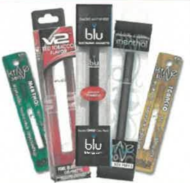
Disposable e-cigarettes, e-hookahs, vape pens