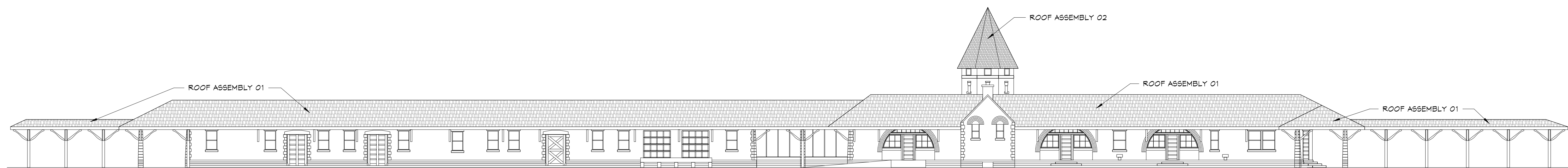
3 EAST ELEVATION SCALE: 1/16" = 1'-0"