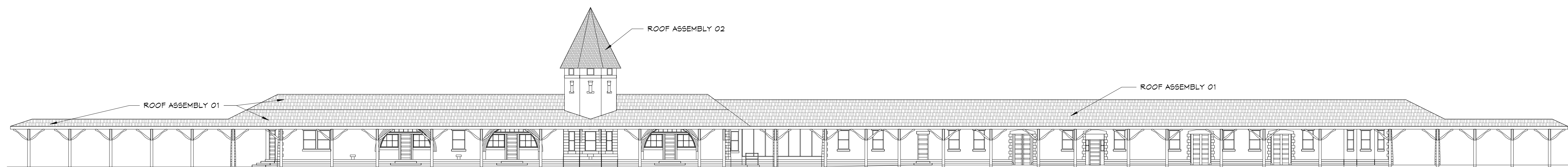
4 WEST ELEVATION SCALE: 1/16" = 1'-0"