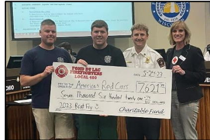
FDLFR and the Local 400 presented a check to the Red Cross for the proceeds made from the Brat Fry that was held in May at Station 1. An amazing $7,621.74 was raised in one day. This is a direct result of great community support. Thank you to everyone who helped with and supported this event!