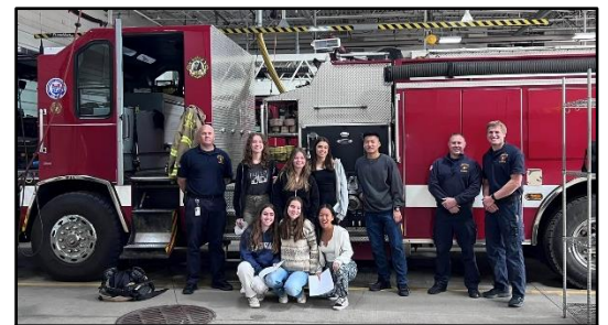
International students studying at Winnebago Lutheran Academy this year stopped at Station 1 for a tour and to learn about fire safety in America.