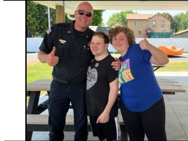
FDLFR enjoys the partnership with The ARC of Fond du Lac. Crews played a game of basketball with The ARC team and had fun at the Ice Cream Social held for First Responders.