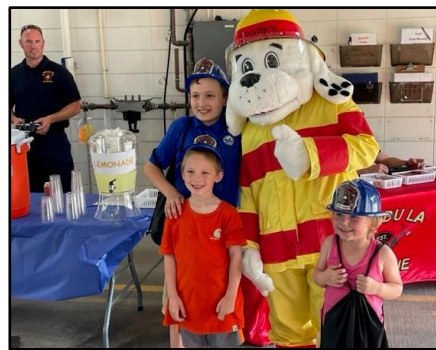
An EMS Open House was held at Station 1 featuring various first aid demonstrations. Sparky was also on hand to meet and greet those in attendance.