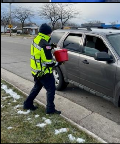
The Bucket Brigade for Salvation Army was a huge success with $22,896 being raised on a Friday morning with a match from the Osborn Family bringing the total raised to $42,896. Awesome community spirit from our members!