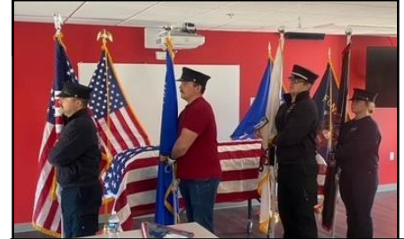
New members of the FDLR Honor Guard recently practiced their crisp movements for the very honorable events they are asked to attend. Thank you for joining this elite group.